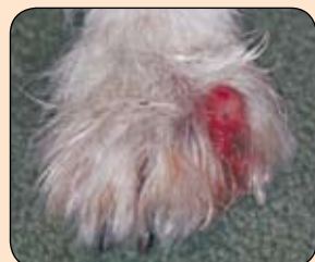
Paw of a dog with an interdigital cyst caused by a grass seed