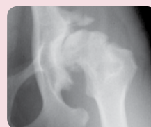
X-ray of an arthritic hip joint in a dog. The symptoms of arthritis are often much worse in overweight pets.